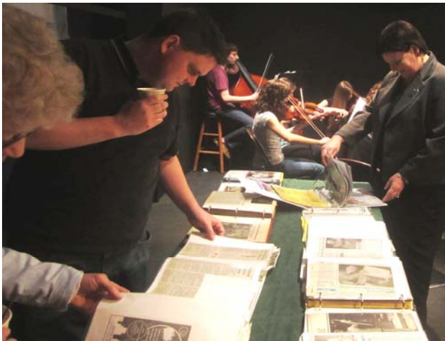
Everyone had a chance to leaf through the scrapbooks that chronicle two decades of community productions and successes.