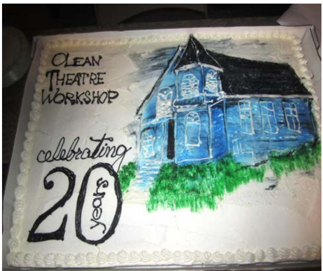
Afterward, everyone enjoyed a delightful cake!