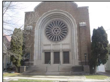
B'Nai Israel Temple

Check out the new photo murals in Applebee's Restaurant on West State Street. Many of these photos were snapped by Mayor Witte and also can be seen on her "Mayor's Community" web page of the city's website, www.cityofolean.org .