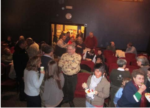
A large and enthusiastic crowd of Workshop participants gathered in the Theatre January 20, 2012 to celebrate the occasion.