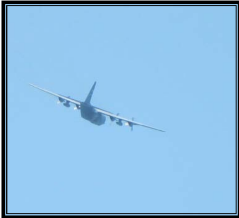
The crowd looked to the sky to observe Olean's first flyover of the downtown Memorial, and to the wreath dropped tin the Allegany River honor fallen soldiers.