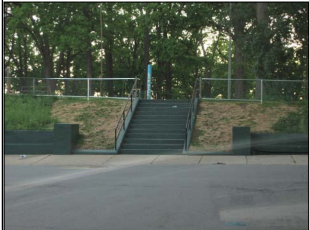
The staircase leading from Laurens Street to Oak Hill Park has been repaired by contractors and the bank has been re-seeded. Other work is under way at Oak Hill Park for public enjoyment!

Why not take a stroll through the business district and pick your favorite arrangement.