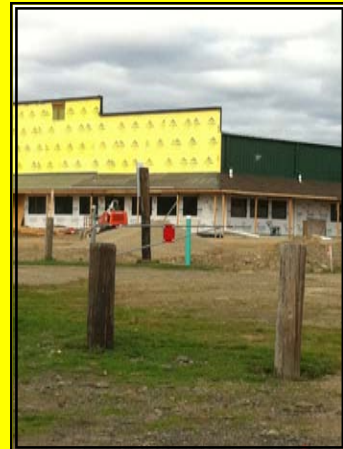
Construction at Good Times speeds along.