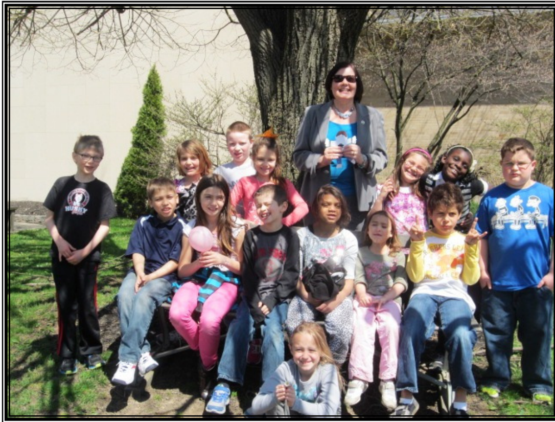
Students from Eastview Elementary School’s 3rd and 4th Grade classes brought Flat Stanley to the Olean Municipal Building to visit Mayor Linda Witte in April. A photograph of the visit was to be posted on the Internet as part of the documentation of Flat Stanley’s travels.