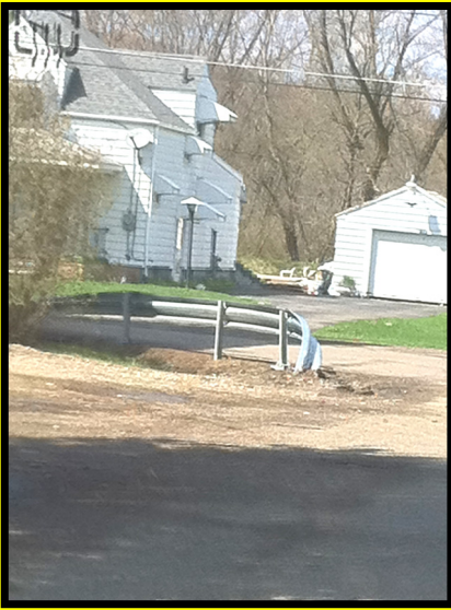
Cattaraugus County replaced a guard rail on Delaware Ave.