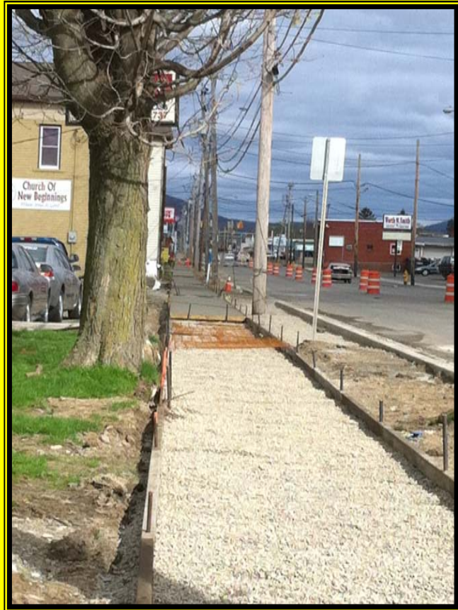
With the Construction Season startup, crews began work on the sidewalks adjacent to East State St. (above).