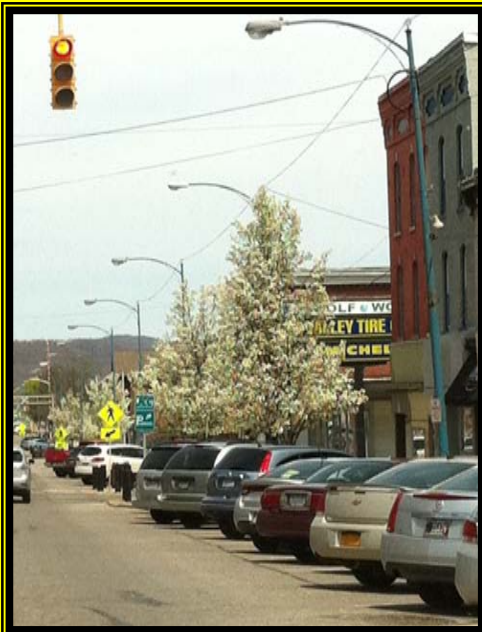
N. Union Street shows off its springtime blossoms.