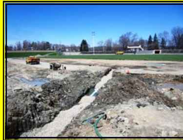
Bradner Stadium drainage work (above and left) will end decades of runoff impoundment (puddles) and extend the Stadium's useful season!