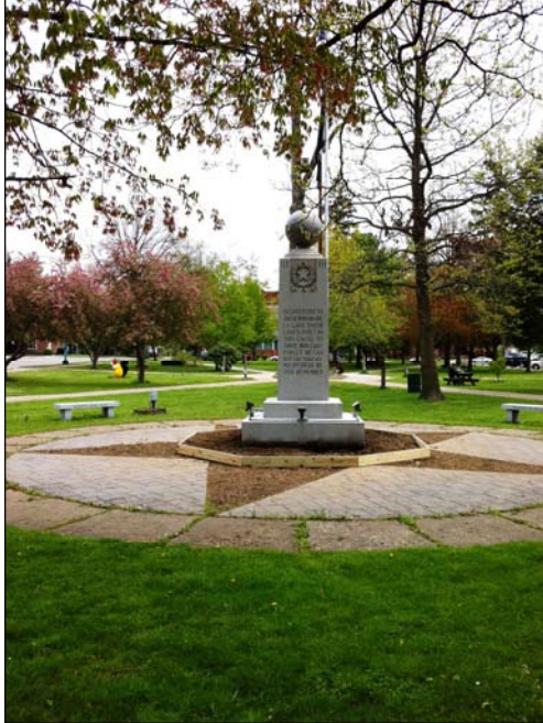
The Gold Star Monument in Lincoln Park is undergoing a renovation this spring, let's see what pops up.