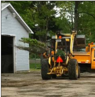
New trees are moved in and planted along East State Street. And Good Times keeps rollin' towards an opening.