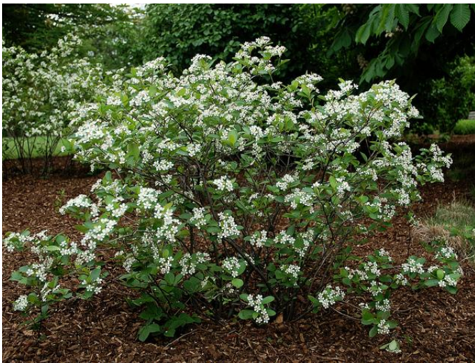
In Spring- Full Bloom

Aronia is considered cold hardy and heat tolerant in USDA Zones 3 to 8. Aronia plants grow well both in orchard-type rows or set as landscape elements. Easily grown in average, medium moisture, well-drained soils in full sun to part shade. Plants have a wide range of soil tolerance including boggy soils. Best fruit production usually occurs in full sun. Remove root suckers to prevent colonial spread.