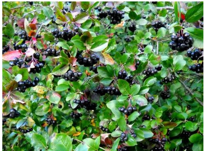
In summer/Fall with berry