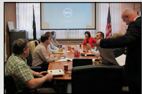
City and county officials met in the Mayor’s conference room in mid-April to discuss economic development our area.