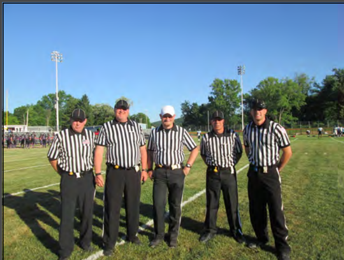
The officiating team prior to the season opener for the Southern Tier Diesel.