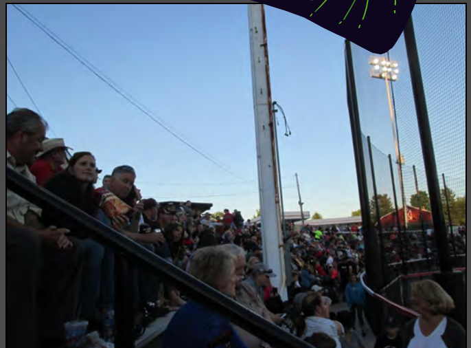
Above: As the Oiler game went on for 11 innings the crowd got larger and larger Below the Southern Tier Diesel as seen by the spectator behind the new netting.