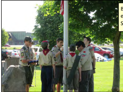
Boy Scout Troop 621 at the Workers' Memorial in Forness Park on Saturday June 7th.