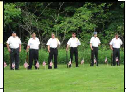
Scenes from the Flag Day ceremony at Olean VFW Post 1619 on June 14, 2012.

It has been a busy couple of weeks—from moving day to opening days to Flag Day. I am proud to report that the Cattaraugus County Senior Nutrition Program has returned to the John Ash Community Center.