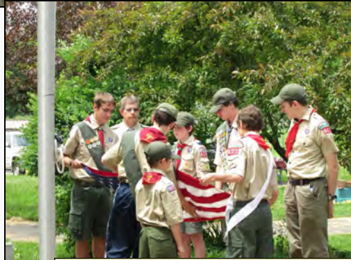
Boy Scout Troop 621 at the Children's Day Celebration at Franchot Park on June 8th..