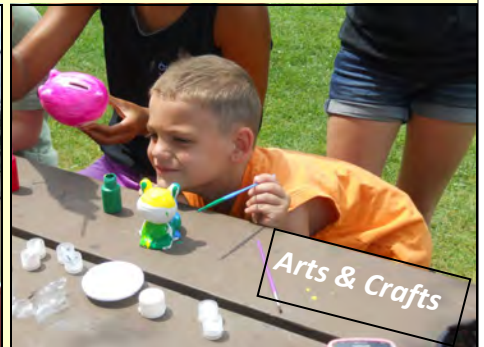
Arts & Crafts