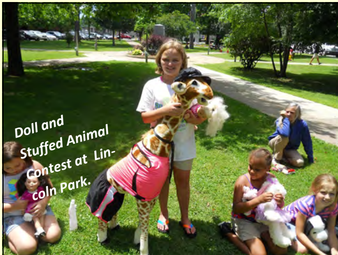
Doll and Stuffed Animal Contest at Lincoln Park.