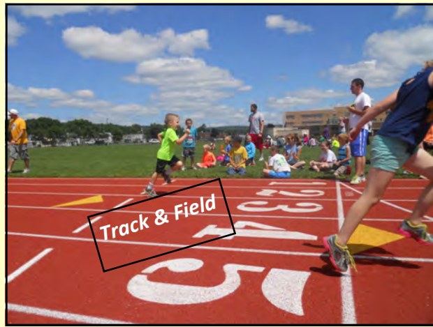
Track & Field