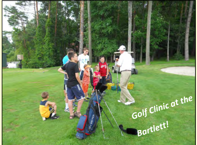
Golf Clinic at the Bartlett!