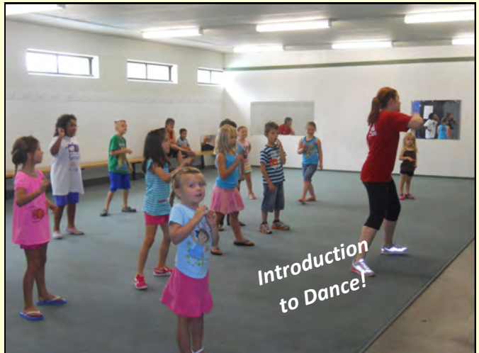
Introduction to Dance!