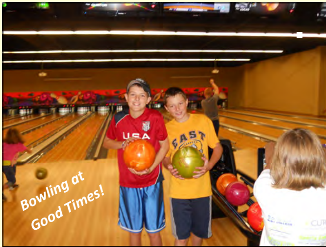
Bowling at Good Times!

The City's Youth & Recreation Department had a banner year. 462 children registered and participated in the 154 various activities, clinics and contests sponsored by the department, The seven week program ran from June 30th until August 15.