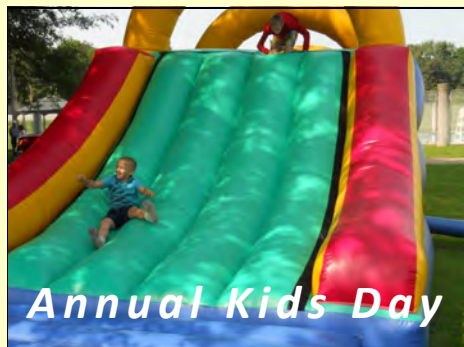
Annual Kids Day