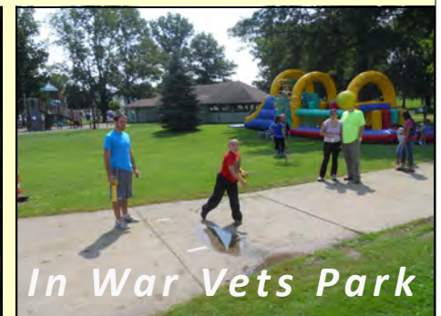
In War Vets Park