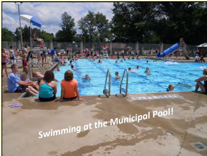
Swimming at the Municipal Pool!