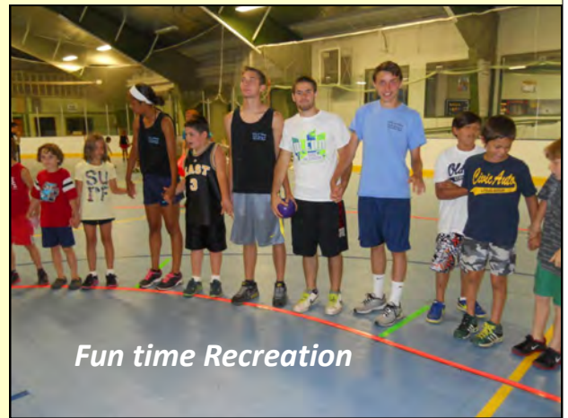
Fun time Recreation