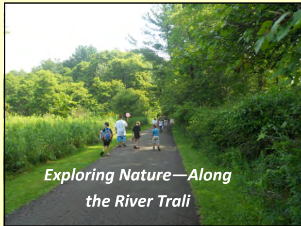
Exploring Nature—Along the River Trail