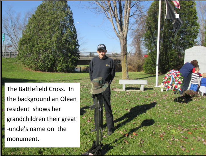
The Battlefield Cross. In the background an Olean resident shows her grandchildren their great-uncle's name on the monument.