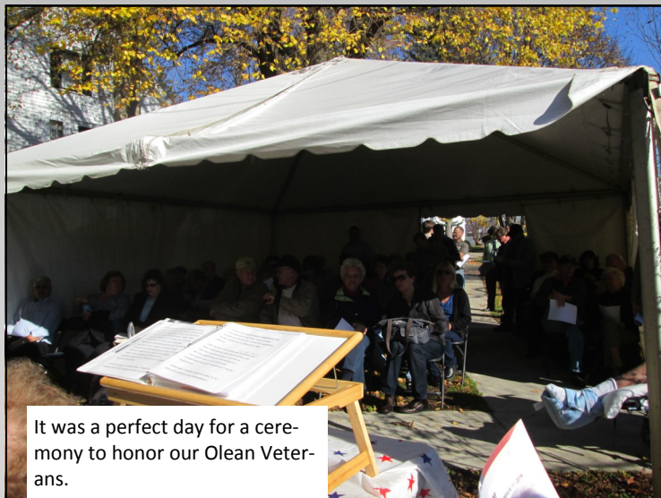
It was a perfect day for a ceremony to honor our Olean Veterans.