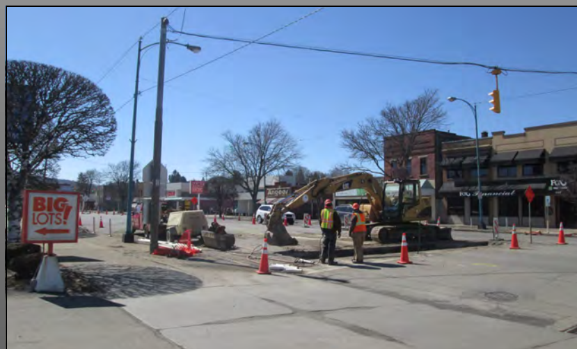
Phase two of the North Union Street construction project has begun. Construction updates are available on the Walkable Olean Website . Please call my office (376-5615) if you have any concerns or comments.