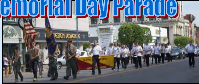
The Olean High School Marching Band is led down South Union St. by a group of local Boy Scouts