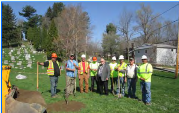
National Grid Employees help the City to plant new trees in Mountain View Cemetery as part of the company's 10,000 Trees and Growing program.