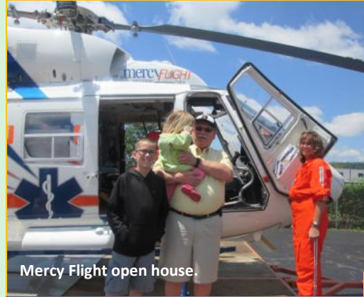
Mercy Flight open house.

Downtown Olean was re-shaping itself for the future. Great pictures of Olean's past are available at the Gabriel Vintage Olean website .