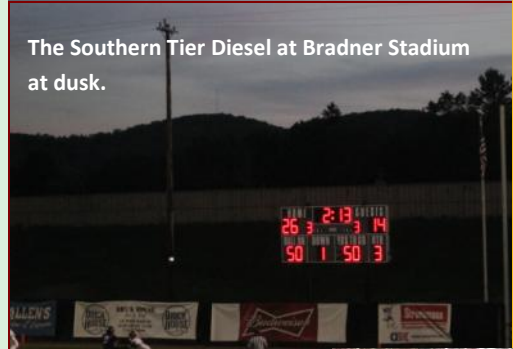
The Southern Tier Diesel at Bradner Stadium at dusk.