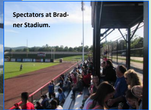
Spectators at Bradner Stadium.