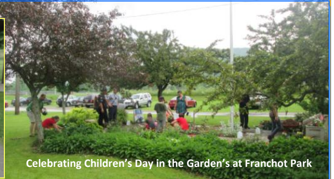
Celebrating Children's Day in the Garden's at Franchot Park