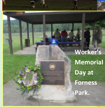
Worker's Memorial Day at Forness Park.