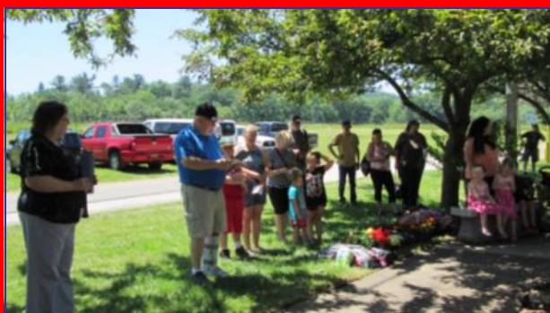
It was a beautiful day for the annual National Children's Day at Franchot Park on June 11, 2017. The event started in Olean in 1995 when the City dedicated a portion of Franchot for a Children's Memorial Garden to establish a living memorial to all children, living or