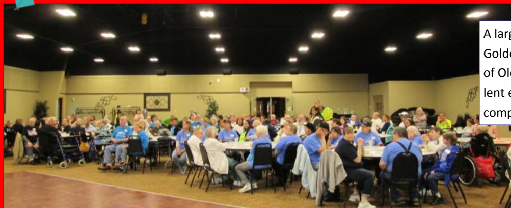
A large crowd was on hand for the Golden Olympics held at Good Times of Olean on June 8, 2017. An excellent event with great competition.